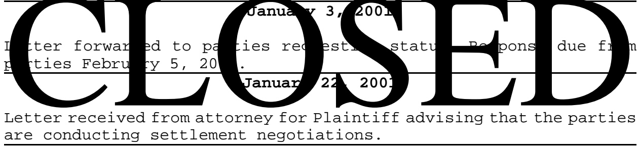
August 6, 2001

Status Report filed by attorney for Defendant advising that the parties are conducting discovery.