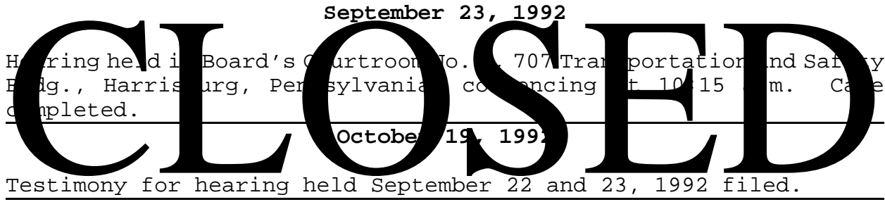
October 23, 1992

Hearing held in Board's Courtroom No. 1, 707 Transportation and Safety Bldg., Harrisburg, Pennsylvania, commencing at 10:10 a.m.